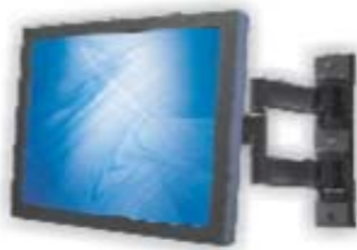
Wall Mount Ready with VESA Pattern 100x100mm 200x200mm