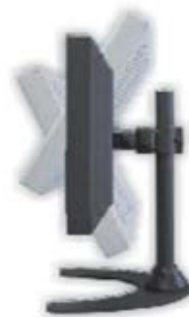
Optional Table Base Stand

All measurements are in inches and pounds, unless noted. Picture and drawings are not to scale. Estimated weight may change depending on additional options. Dynics reserves the right to change, modify, upgrade or discontinue to its discretion any part of this datasheet without any prior notice.